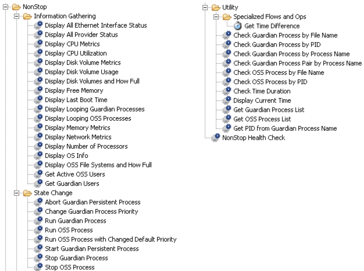
Figure 1 – HP NonStop flows in the Library/Accelerator Packs/Operating Systems/NonStop/ folder