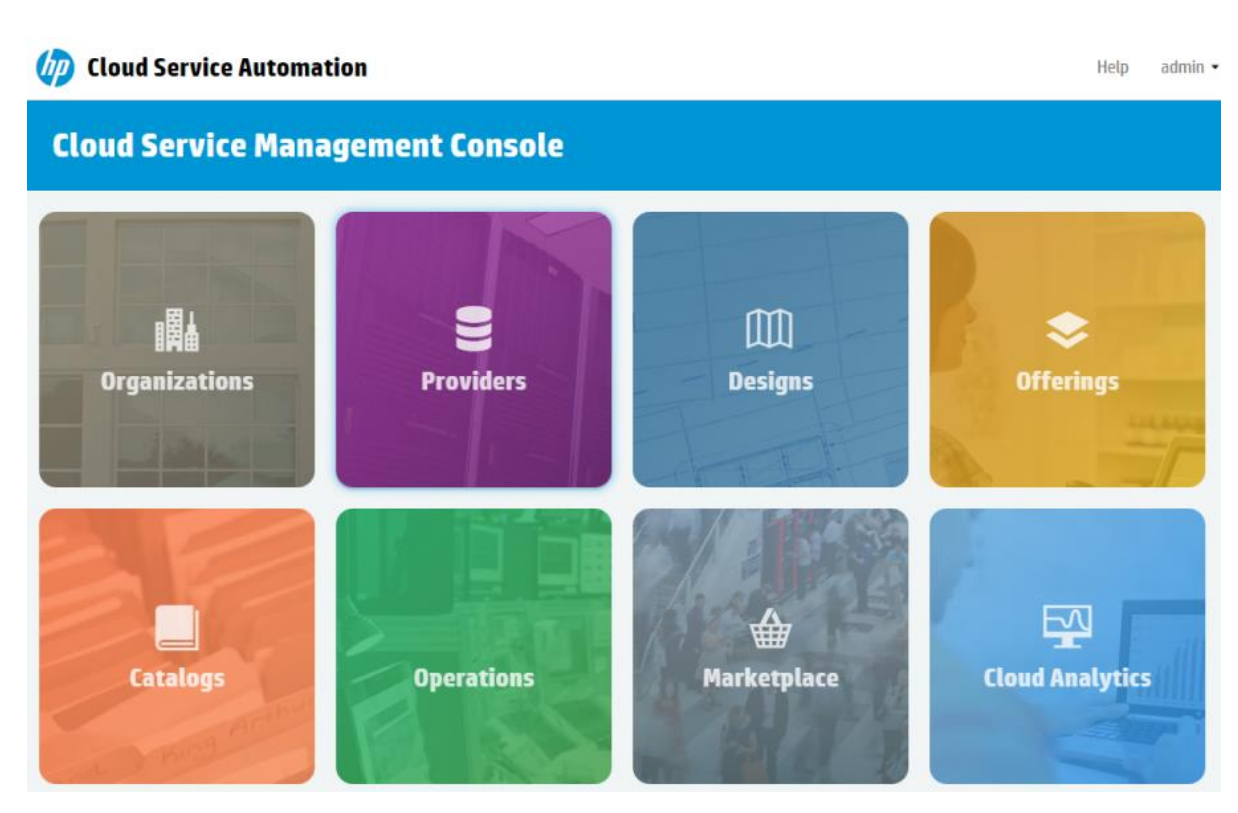
Figure 3 Cloud Service Management Console Dashboard